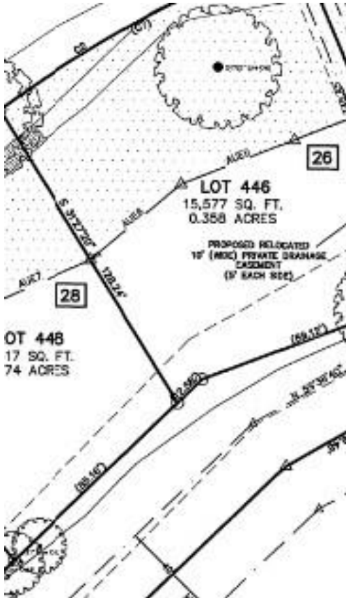
Plat Information Example