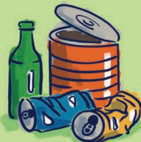
ALUMINUM & STEEL CANS