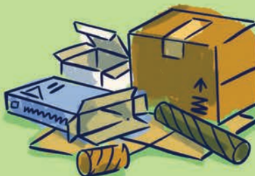
PAPERBOARD & FLATTENED CARDBOARD