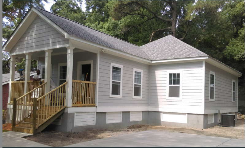
New Construction Project (P.A.S.T.O.R.S., Inc.)

Charleston County and the City of North Charleston have partnered to manage U.S. Housing and Urban Development (HUD) funds. The purpose of this funding is to provide clean, suitable, and decent living conditions for the area's low-to-moderate income population. By working closely with other government agencies and organizations, we accomplished the following goals: