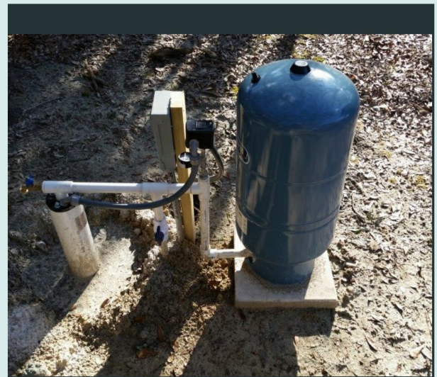
New Well System (Charleston County)